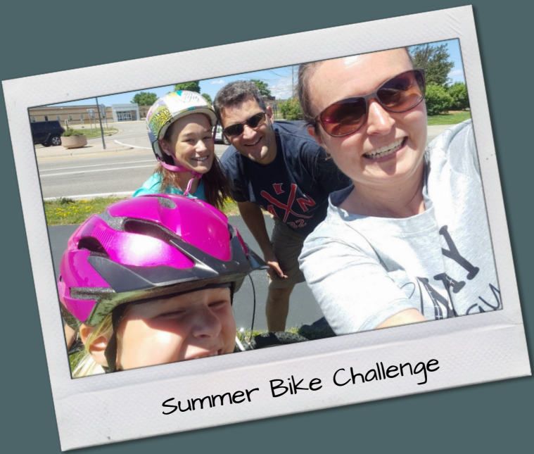
Summer Bike Challenge