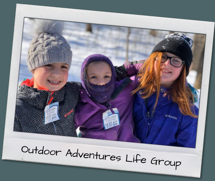
Outdoor Adventures Life Group